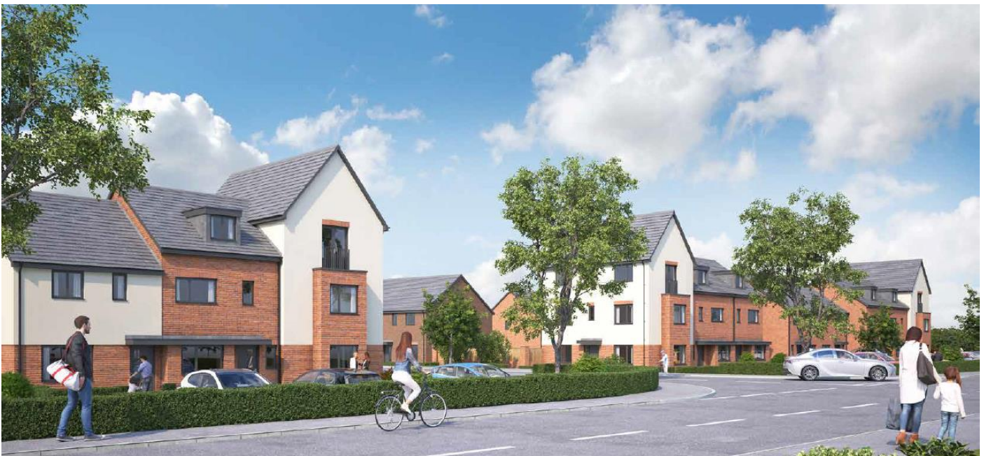
New entrance at Lincoln Road