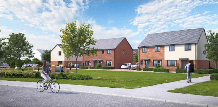
Indicative CGI visualisation

Following some further redesign, revised plans have now been submitted to planning for approval. The plans were revised following comments from Nottinghamshire County Council Highways, Sport England, and Planning and were shared with local residents at a public meeting earlier in the summer at the Bridge Community Centre.