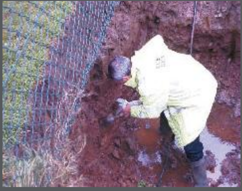
Clean up of ground after leaking tank removed, showing drinking water pipe through ground.