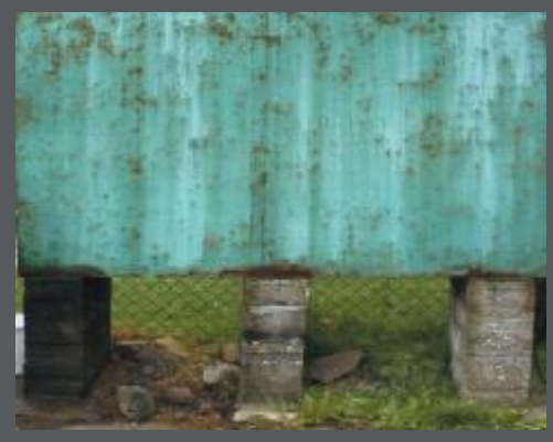
An example of a corroded tank with left hand side support stained with oil & ground soaked with oil.