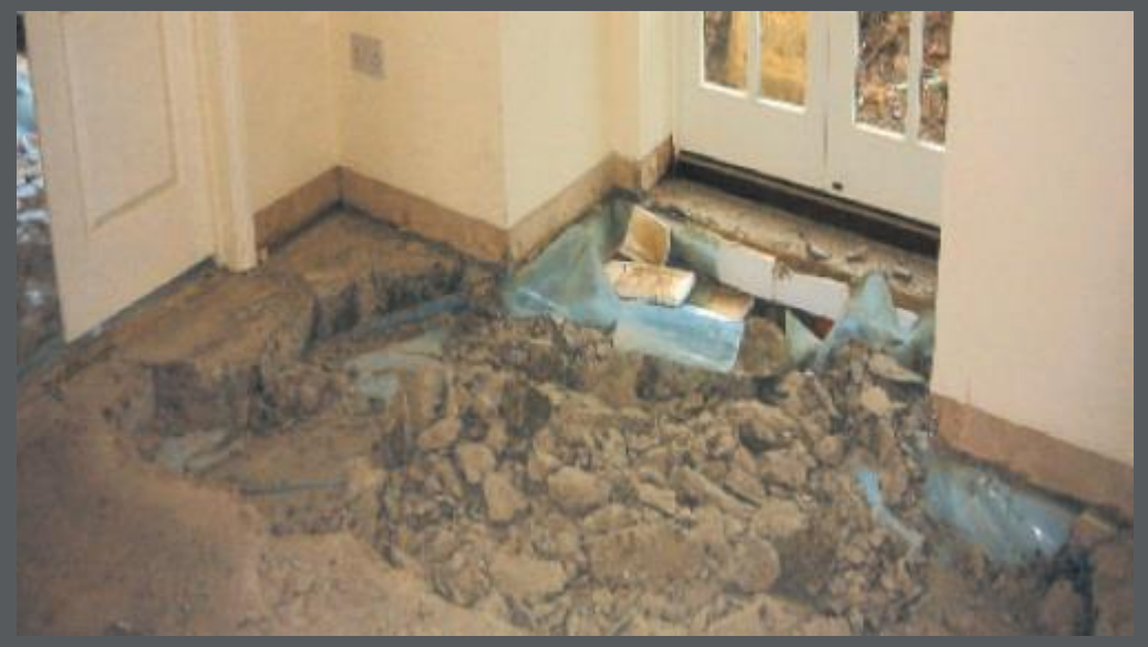
An example of a house being cleaned up following a leak of oil.

A central heating oil tank mounted on concrete block supports corroded. Oil leaked out of the tank, staining the support and soaking into the ground below. Water pipes to two houses ran under the spill area. As oil can penetrate plastic water supply pipes, there was a serious risk of the water supply being contaminated. The water pipes had to be replaced and the contaminated soil removed. Costs ran into several thousands of pounds.