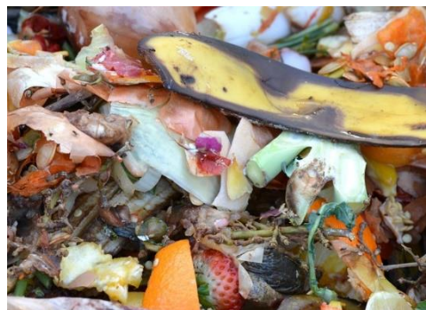
food waste & vegetable peelings