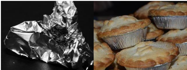
aluminium foil & foil trays