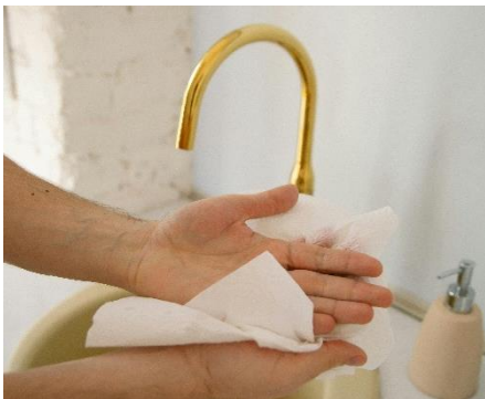
paper towels & wet wipes