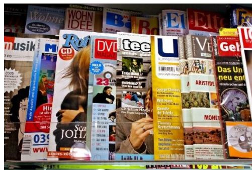
magazines & catalogues