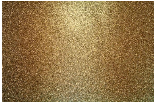
glitter or foil on paper/ card