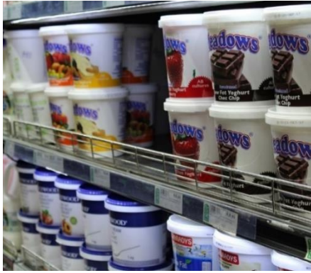
yoghurt pots (no lids)