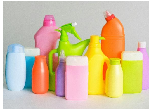
plastic cleaning & soap bottles (no spray trigger nozzles)