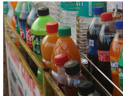
plastic drink bottles (keep lids on & squash)