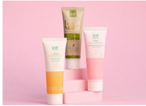
tubes & lids