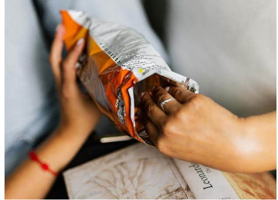
packets & wrappers