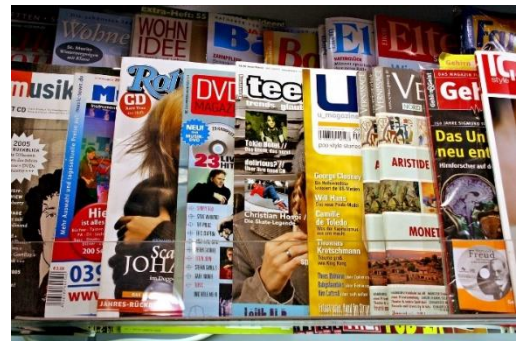
magazines & catalogues