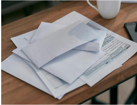
envelopes & junk mail