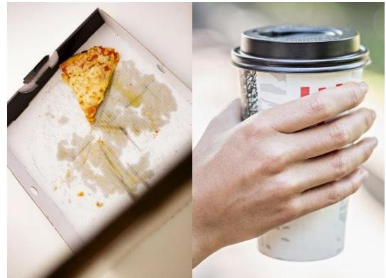
takeaway packaging & cups