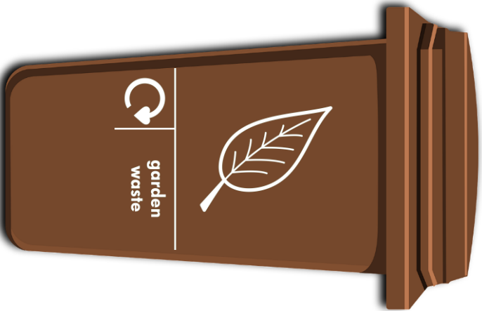
Recycling Relay – Garden Waste Bin