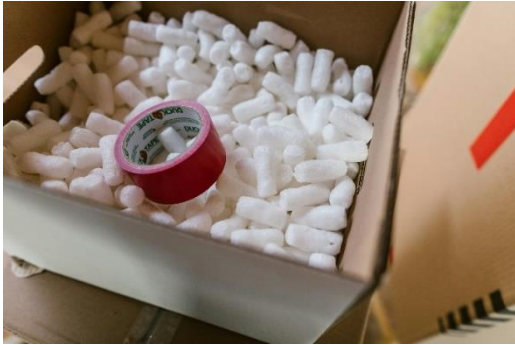
polystyrene & bubble wrap