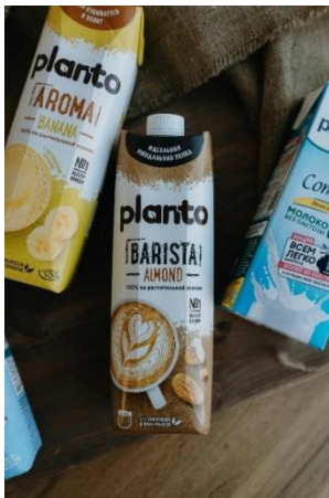
food & drinks cartons