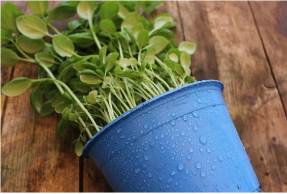
plant pots & seed trays