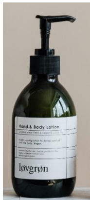
glass toiletry bottles (no dispensing pumps)