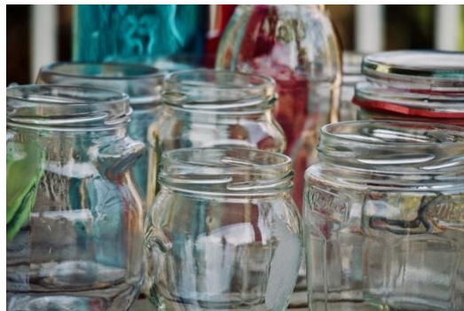
glass food jars (no lids)