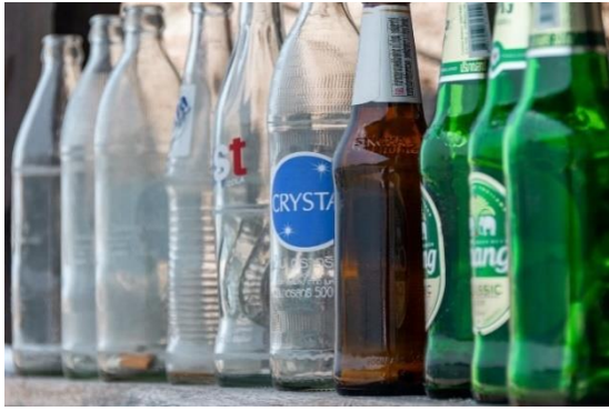
glass drinks bottles (no lids)