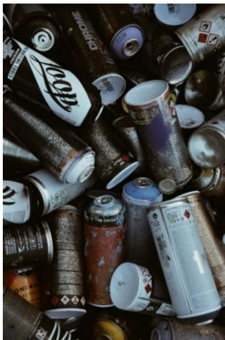
empty aerosol cans