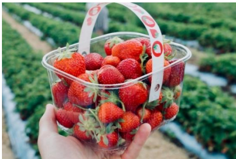
plastic food trays, punnets & containers