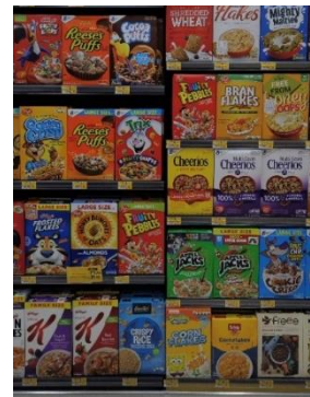
cereal boxes & cardboard packaging