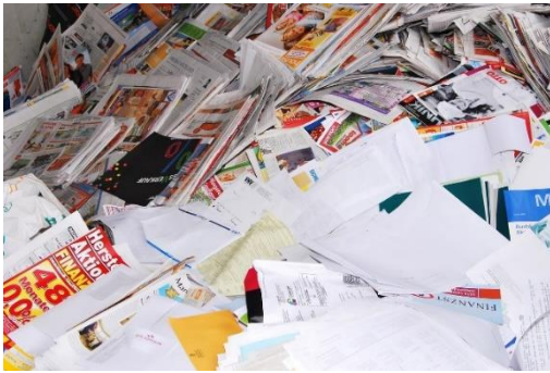
envelopes & junk mail