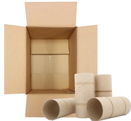
cardboard boxes & tubes