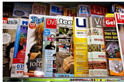
magazines & catalogues