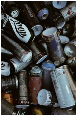
empty aerosol cans