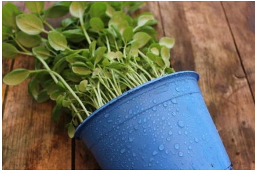
plastic plant pots