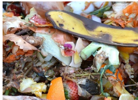
food waste & vegetable peelings