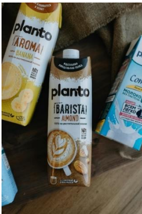
food & drinks cartons