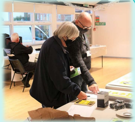
Image: Millgate drop-in session

⇒ Other events were run for residents of Mill Gate and the surrounding areas. They were invited to attend any of the 3 community drop-in event at Millgate Community centre as part of the Safer Streets Newark project. Visitors completed a survey to have their say on safety in the area and give them the opportunity to share their ideas on how it could be improved. The information collected at these sessions will be used to inform future policing and Community safety interventions. Residents were also given the opportunity to join a neighbourhood watch group.