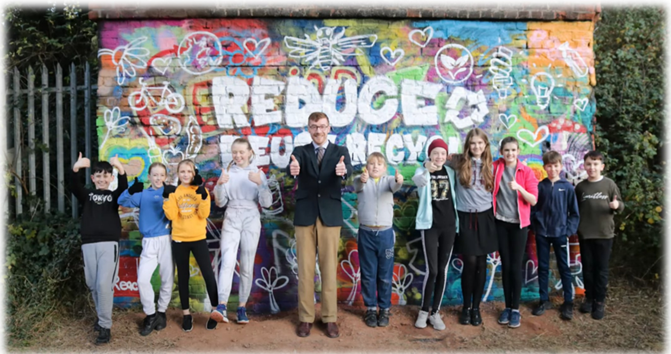
Image: Reduce, Reuse and Recycle' graffiti mural on the Newark Sustrans route

"The graffiti wall that was done @ Clipstone Youth Club is absolutely amazing, thank you to Newark & Sherwood & to the graffiti artists. Its truly made the youth club a centre place of our village."