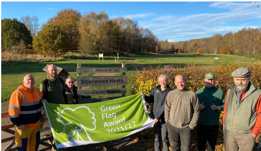
Members of the Ranger and Grounds Maintenance teams joined Sherwood Forest Trust Team members, Friends of Sherwood Heath members and Volunteer Rangers to celebrate their green flag award.

"I would like to congratulate the hedge cutters on Devon Park Sconce Hills. After last years mess when the hedges were slashed and cut whilst the birds were still nesting, It was good to see them being cut by hand today well out of the nesting season and the top job that is being done."