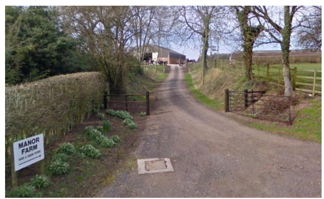
Plate 1 Gate at Manor Farm - similar style to that proposed for the site access