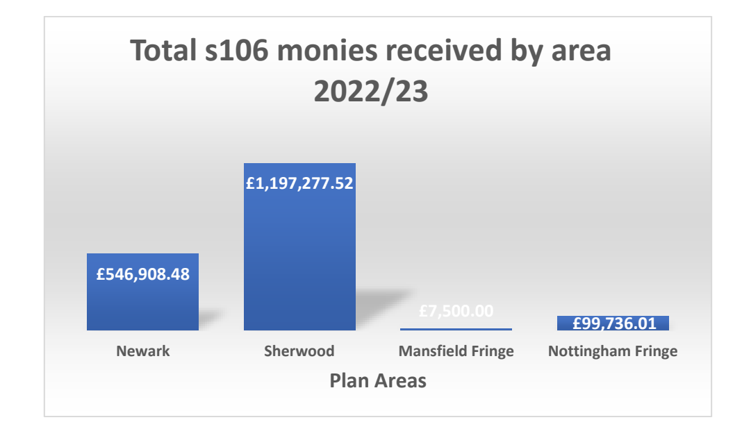
Figure 2: Total s106 Monies received by Strategic Sub Area in 2022/23

the proportion was 38.78% in 2022/23; this compares with 28.75% in 2021/22 and 16.55% in 2020/21.