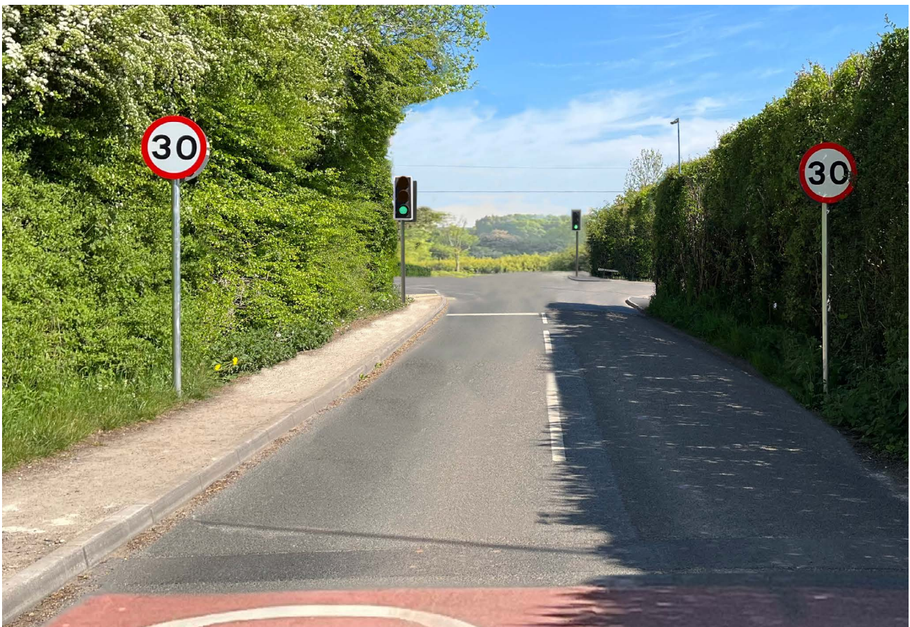
Existing Kirklington Road outbound from Southwell