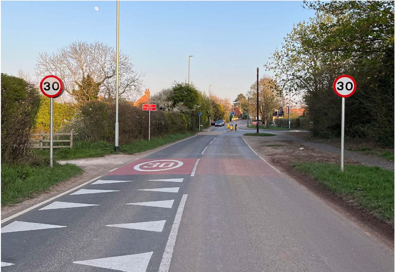
Existing Lower Kirklington Road inbound from Kirklington