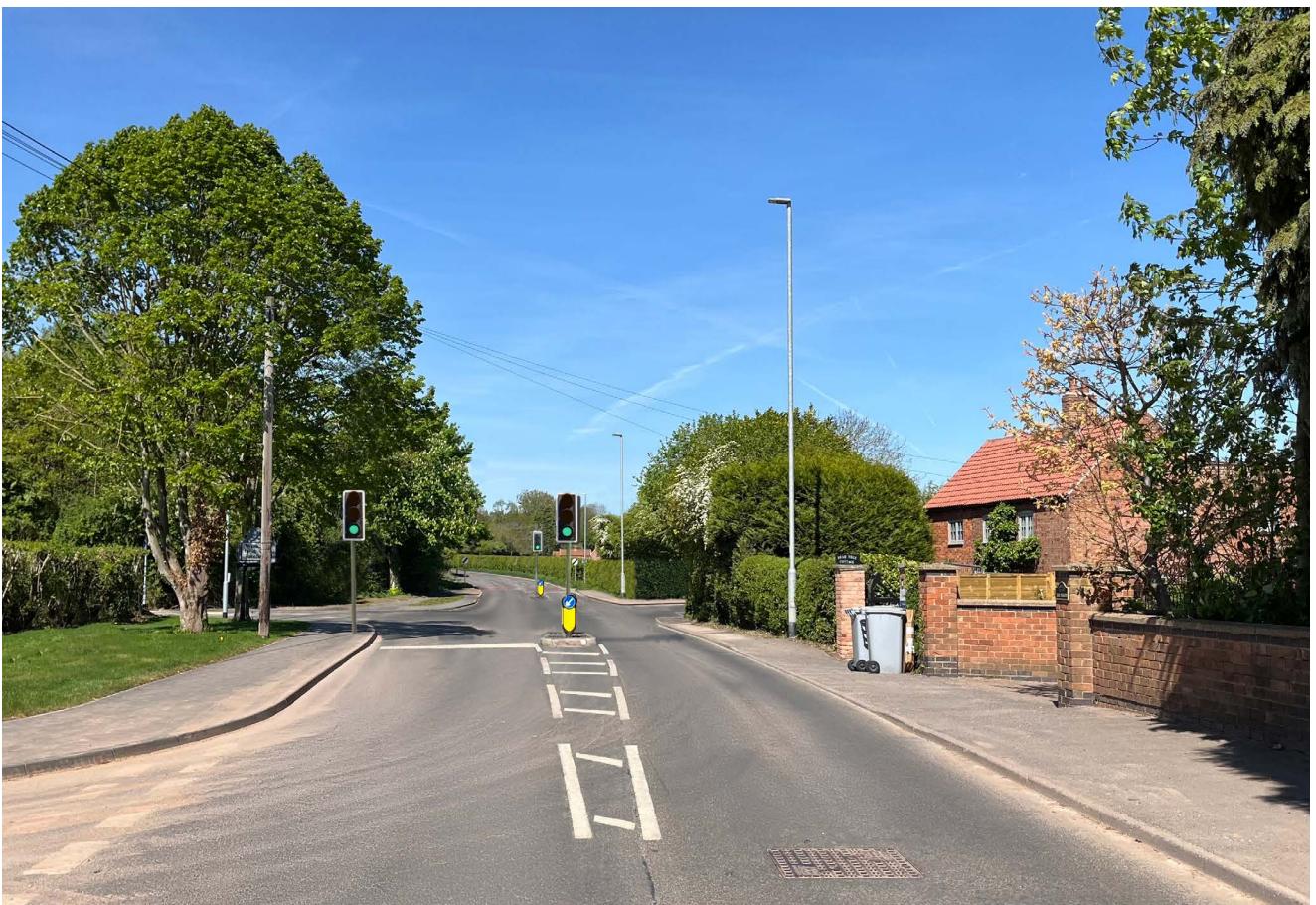
Proposed Kirklington Road outbound from Southwell