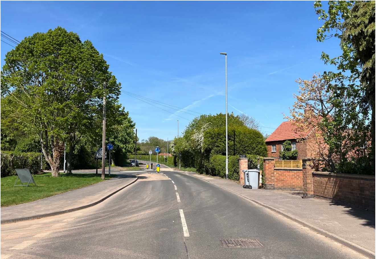
Existing Kirklington Road outbound from Southwell