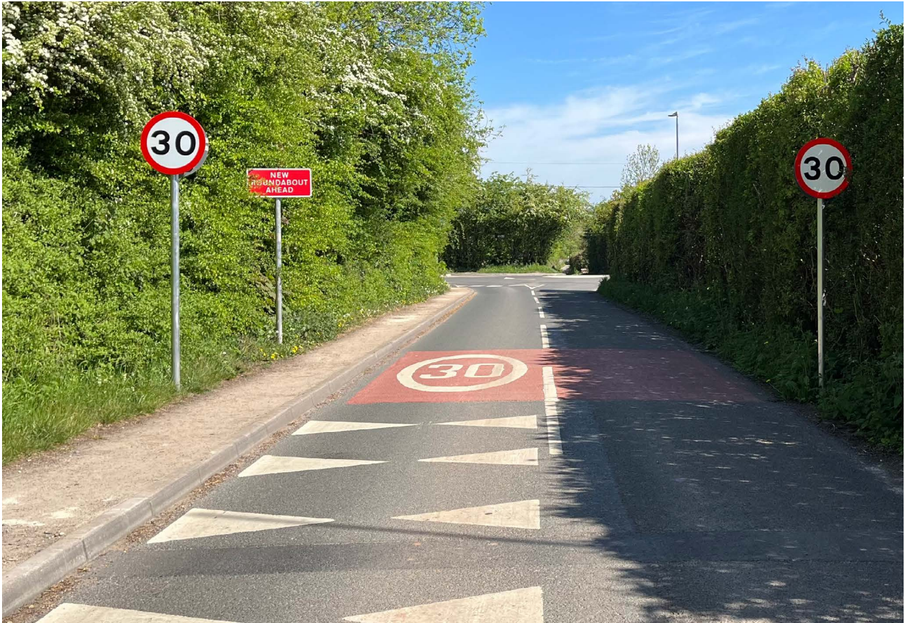
Existing Kirklington Road outbound from Southwell