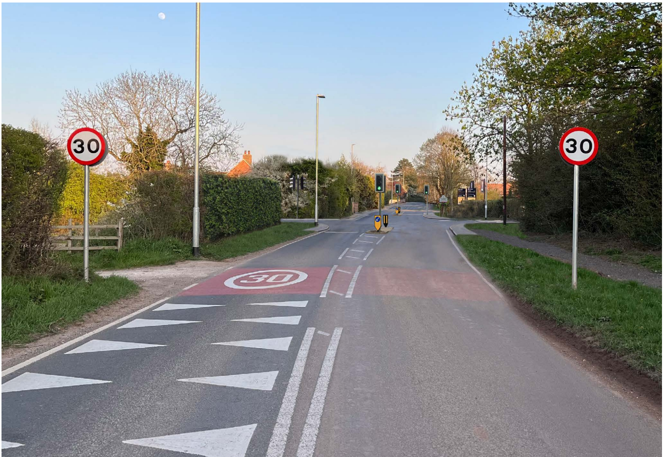
Proposed Lower Kirklington Road inbound from Kirklington