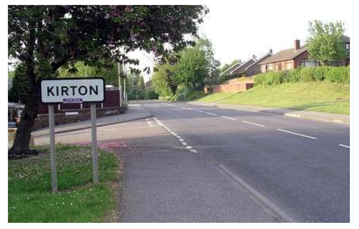
MN33-3 MN13 G:\LANDSCPE\DATA\LCA\LCA Pictures\Mid-Nottinghamshir