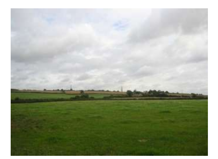
MN33-5 MN13 G:\LANDSCPE\DATA\LCA\LCA Pictures\Mid-Nottinghamshir