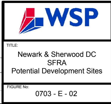
2. Land South of Rainworth Bypass, Rainworth