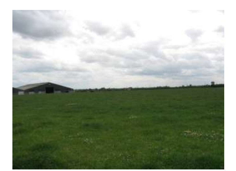
ES11-3 ES04 G:\LANDSCPE\DATA\LCA\LCA Pictures\East-Nottinghamsh