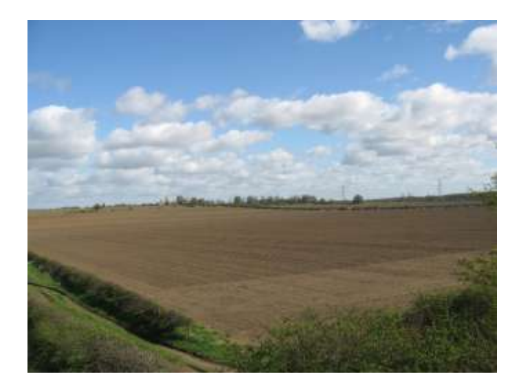
ES10-5 ES04 G:\LANDSCPE\DATA\LCA\LCA Pictures\East-Nottinghamsh