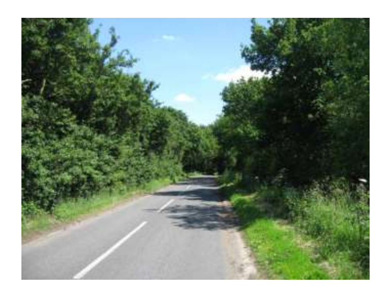
ES05-4 ES02 G:\LANDSCPE\DATA\LCA\LCA Pictures\East-Nottinghamsh