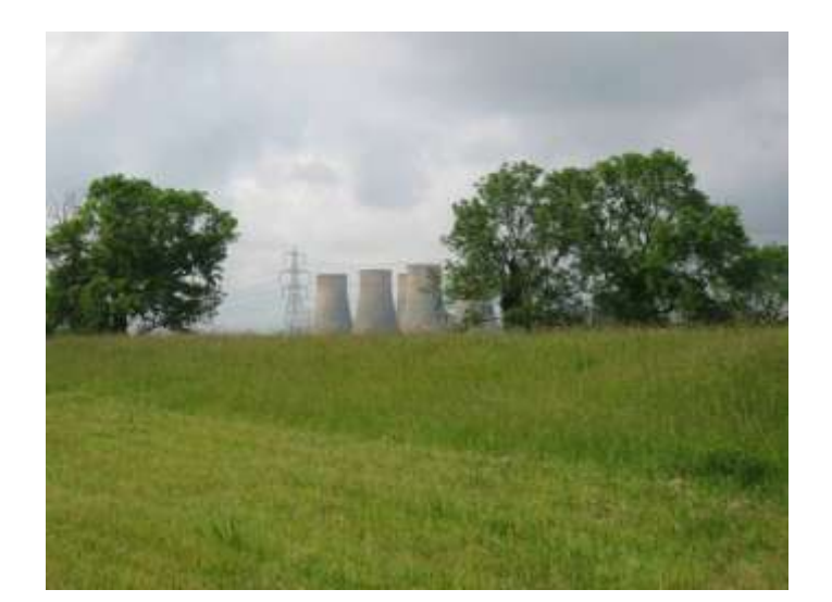
ES01-2 ES01 G:\LANDSCPE\DATA\LCA\LCA Pictures\East-Nottinghamsh