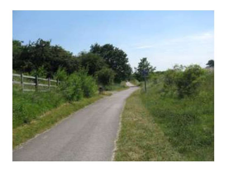
ES13-4 ES06 G:\LANDSCPE\DATA\LCA\LCA Pictures\East-Nottinghamsh