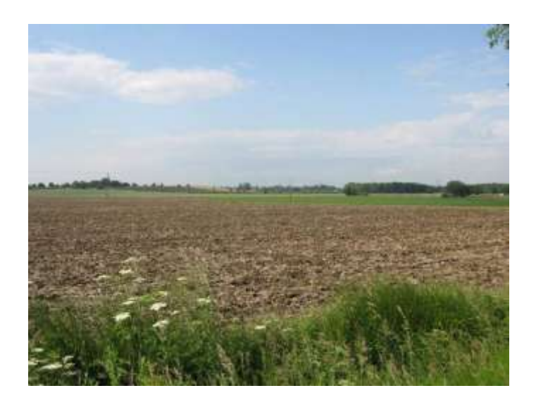
ES08-1 ES04 G:\LANDSCPE\DATA\LCA\LCA Pictures\East-Nottinghamsh