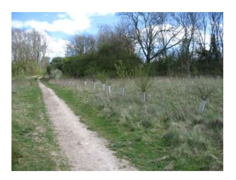
ES11-1 ES04 G:\LANDSCPE\DATA\LCA\LCA Pictures\East-Nottinghamsh