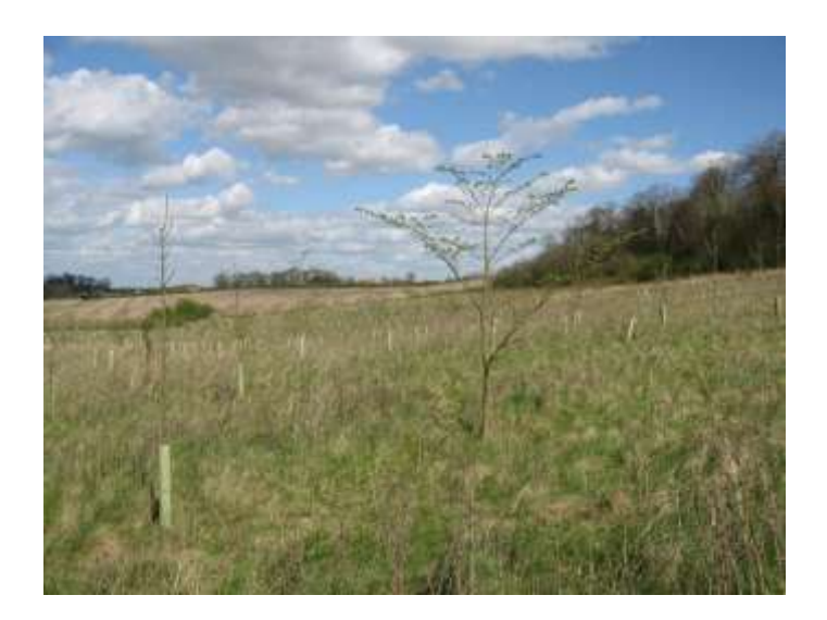
ES10-7 ES04 G:\LANDSCPE\DATA\LCA\LCA Pictures\East-Nottinghamsh