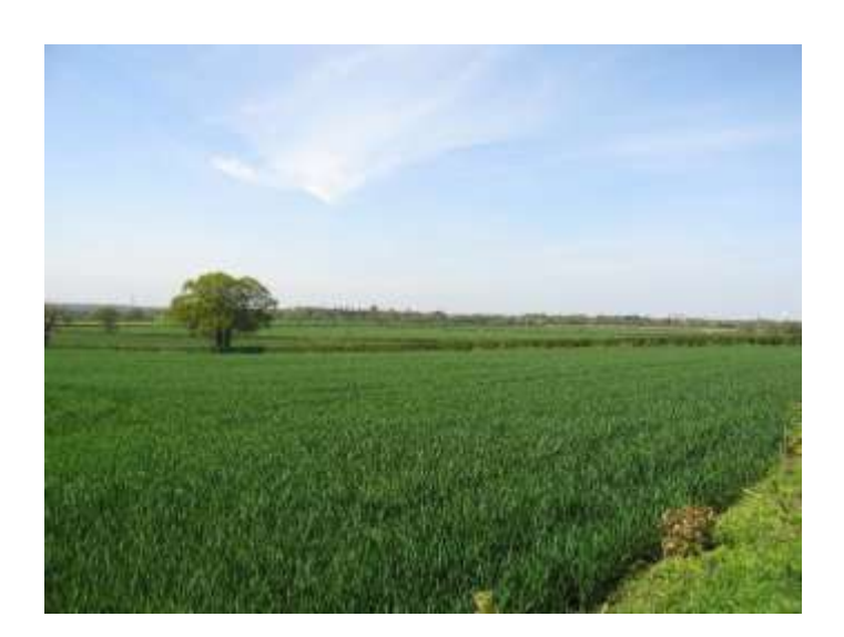
ES09-1 ES04 G:\LANDSCPE\DATA\LCA\LCA Pictures\East-Nottinghamsh