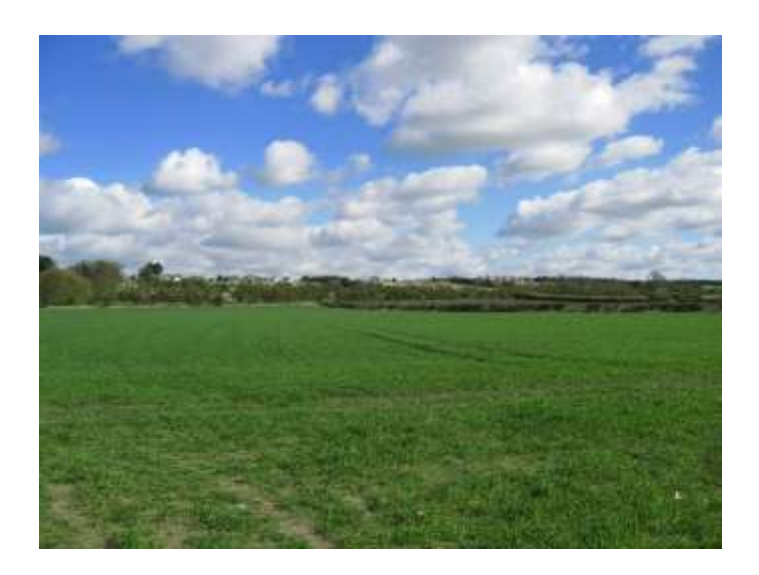
ES10-3 ES04 G:\LANDSCPE\DATA\LCA\LCA Pictures\East-Nottinghamsh