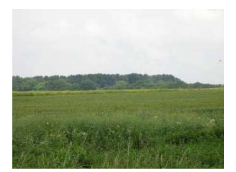
ES03-4 ES02 G:\LANDSCPE\DATA\LCA\LCA Pictures\East-Nottinghamsh