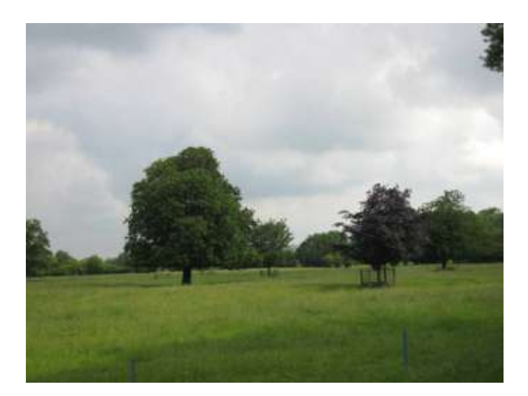
ES02-7 ES02 G:\LANDSCPE\DATA\LCA\LCA Pictures\East-Nottinghamsh