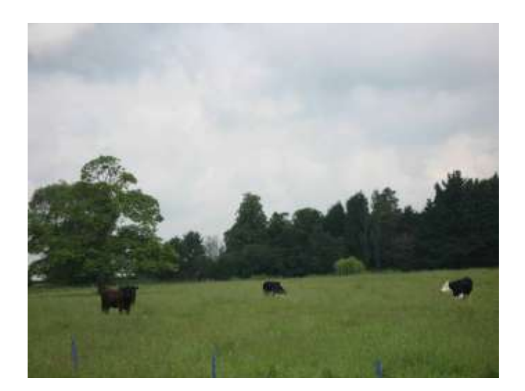
ES02-5 ES02 G:\LANDSCPE\DATA\LCA\LCA Pictures\East-Nottinghamsh