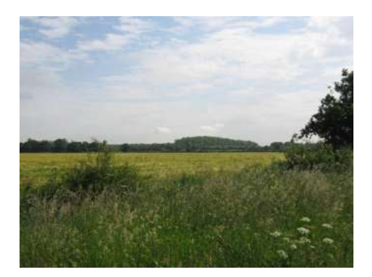
ES06-4 ES04 G:\LANDSCPE\DATA\LCA\LCA Pictures\East-Nottinghamsh