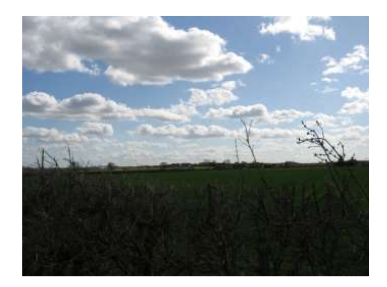
ES10-1 ES04 G:\LANDSCPE\DATA\LCA\LCA Pictures\East-Nottinghamsh